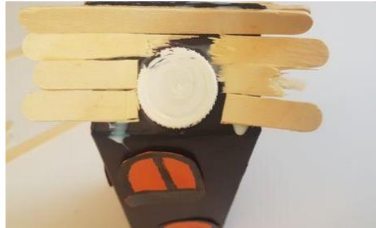
Step 5 If your carton has a cap, cut lollipop sticks to fit around the cap and glue them to the top of the carton. You can also use a white paper cap and glue it to the top of the carton. You can also use a white paper cap and glue it to the top of the carton.