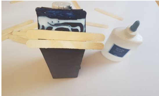
Step 4 Glue lollipop sticks to the top of your carton to make a roof.