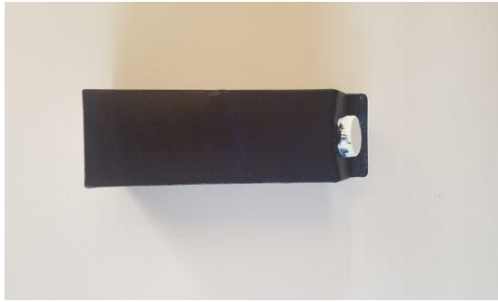
Step 1 Paint Carton and allow to dry.