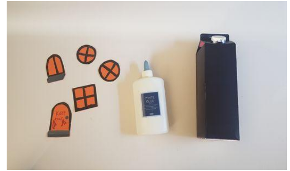
Step 3 Glue windows and doors onto all 4 sides of the painted carton using PVA glue.