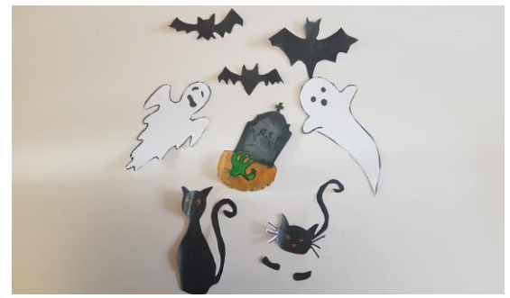
Step 6 Colour and cut out a selection of Halloween images. You can use the templates or draw your own.